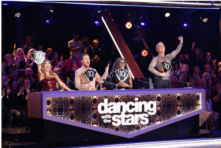
Series photos are available here .

"Dancing with the Stars" (6.54 million Total Viewers and 0.98 rating among AD18-49 in MP+3):