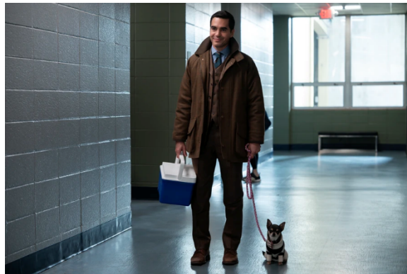
Series photos are available here.

ABC's 'Will Trent' Grows to New Series High in Total Viewers Scores Its Biggest Delayed-Viewing Increases So Far This Season Grows Over Year-Ago Telecast for 3rd Straight Week Delivers ABC's Top Scripted Telecast in Nearly 2 Years