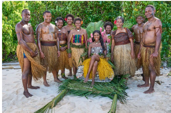
ABC/Craig Sjodin* Series photos are available here .

"The Bachelorette" (4.4 million Total Viewers and 1.23 rating in AD18-49 in MP+3):