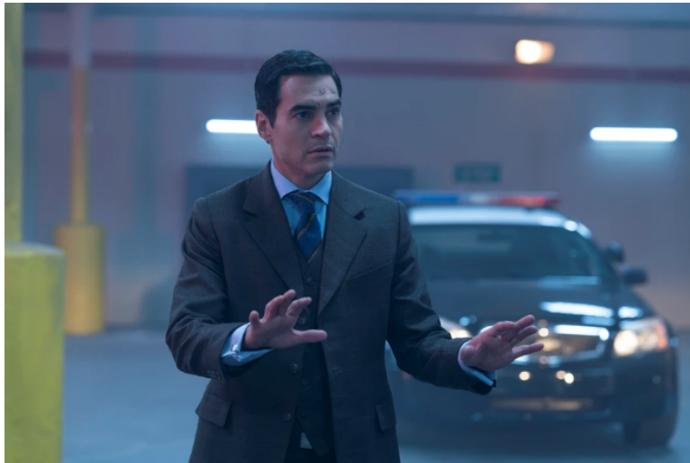
Series photos are available here .

"Will Trent" (6.87 million Total Viewers and 0.86 rating among AD18-49 in MP+3):