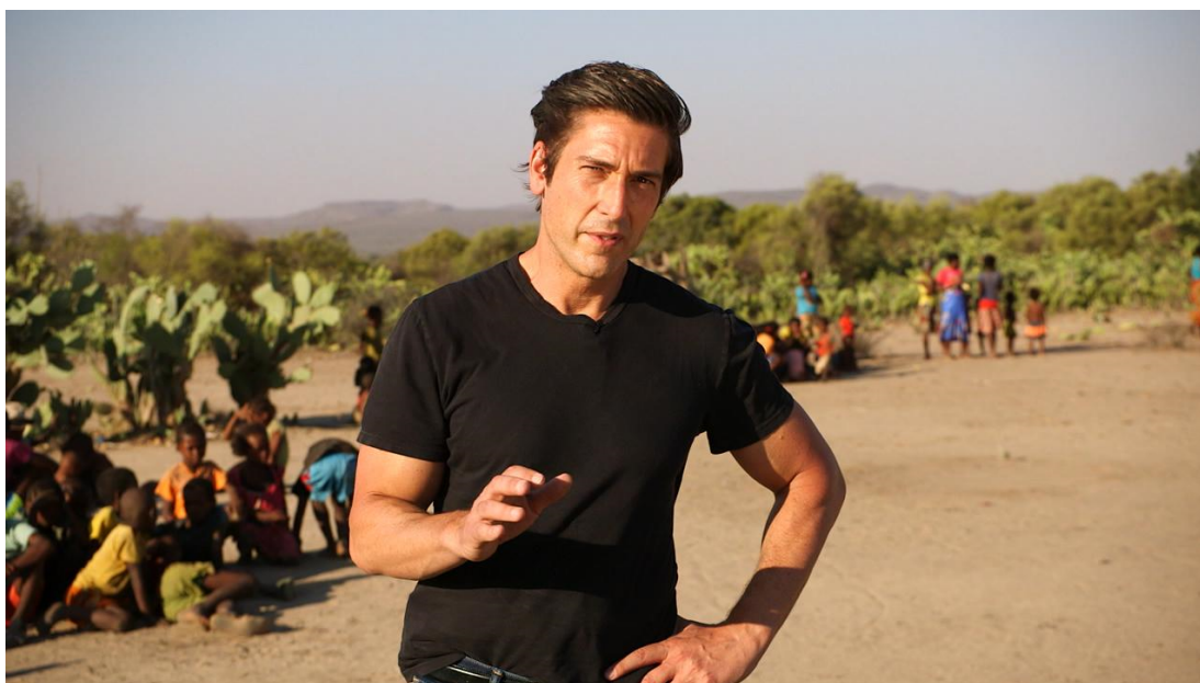
ABC's David Muir is first American network journalist to report from Southern Madagascar with the World Food Program on climate-driven famine

(COP26), with on-the-ground reporting from chief White House correspondent Cecilia Vega and foreign correspondent Maggie Rulli beginning Oct. 31.