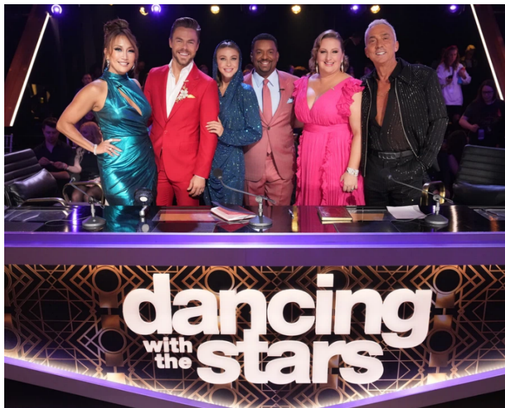
Disney/Eric McCandless* Series photos are available here .

Builds for 3 rd Straight Week and Posts Its Biggest Week-to-Week Gains