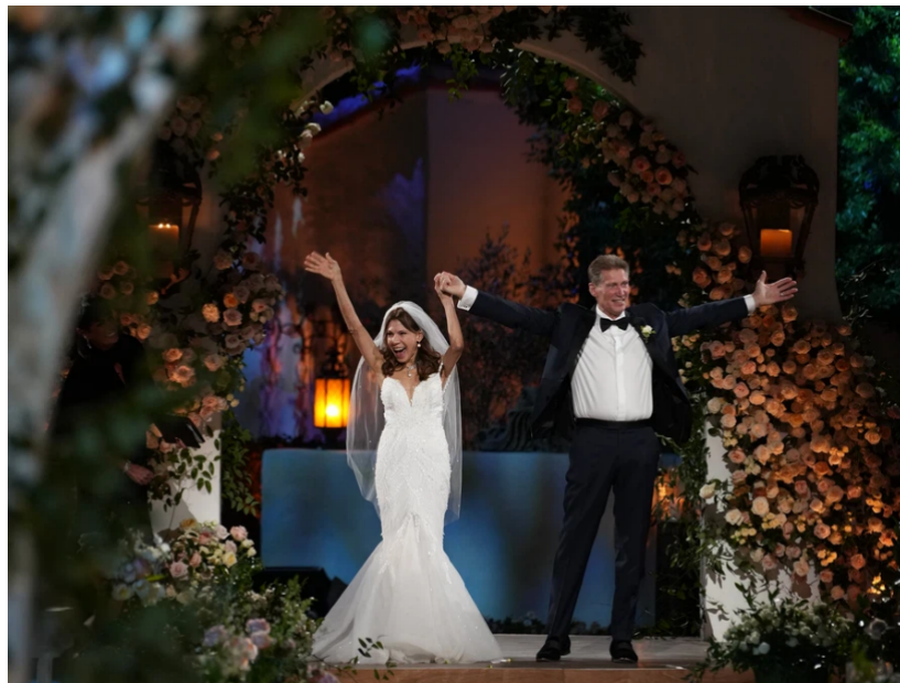
Series photos are available here .

"The Golden Wedding" (7.13 million Total Viewers and 1.29 rating among AD18-49 in MP+7):