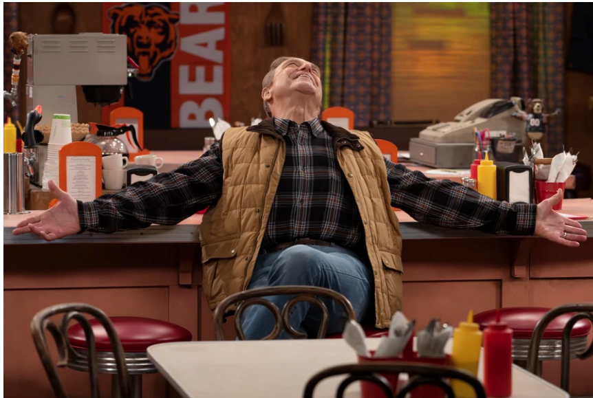
Series photos are available here .

"The Conners" (4.60 million Total Viewers and 0.74 rating among AD18-49 in MP+3):