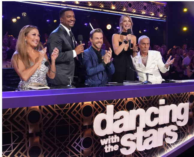
Series photos are available here .

"Dancing with the Stars" (6.50 million Total Viewers and 1.08 rating among AD18-49 in MP+3): After just three days of viewing across linear and streaming platforms, the season premiere of ABC's "Dancing with the Stars" jumped to 6.50 million Total Viewers and hit a 1.08 rating among Adults 18-49.