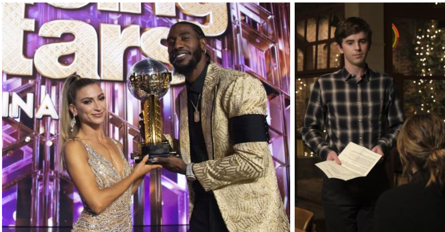
Series photos are available here.

'Dancing with the Stars' and 'The Good Doctor' Finales Match Season Highs