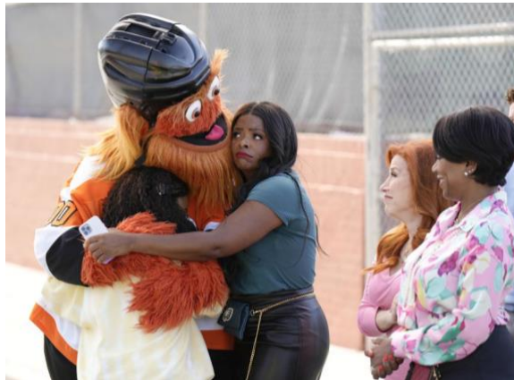
Series photos are available here.

Posts Largest Delayed-Viewing Lift for Any ABC Comedy Ever in Adults 18-49