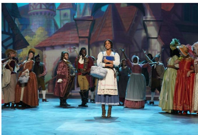
Show photos are available here .

ABC Special Gains +2.0 More Million Viewers in Delayed Multiplatform Viewing