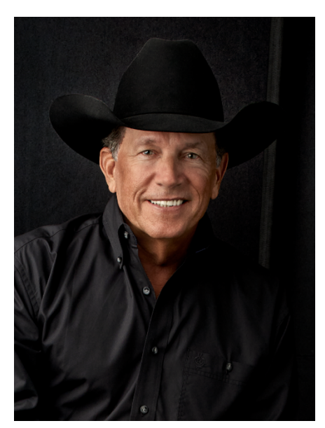
George Strait <u>Download Photo</u>