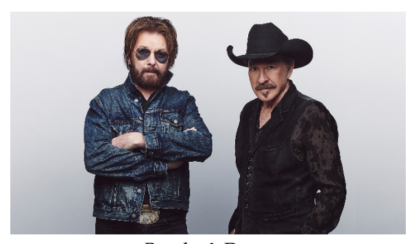
Brooks & Dunn <u>Download Photo</u>