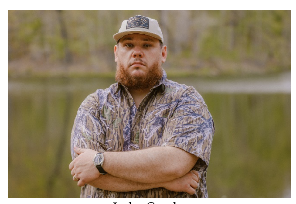
Luke Combs <u>Download Photo</u>