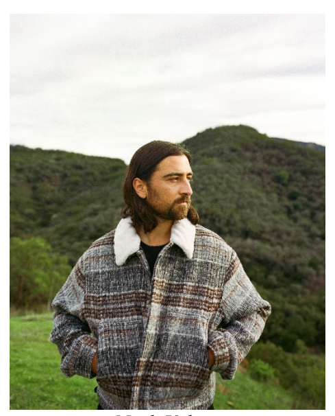
Noah Kahan Photo Credit: Download Photo