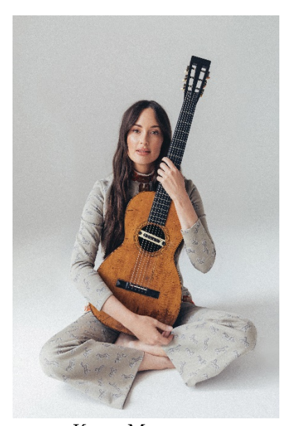
Kacey Musgraves <a href="Download Photo">Download Photo</a>