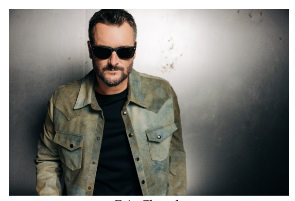
Eric Church Download Photo