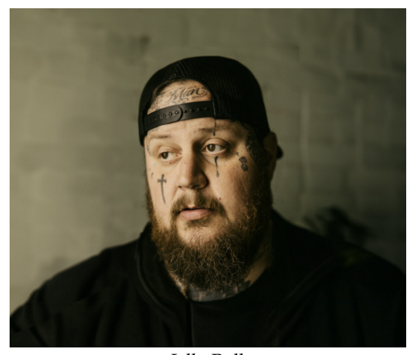
Jelly Roll <u>Download Photo</u>