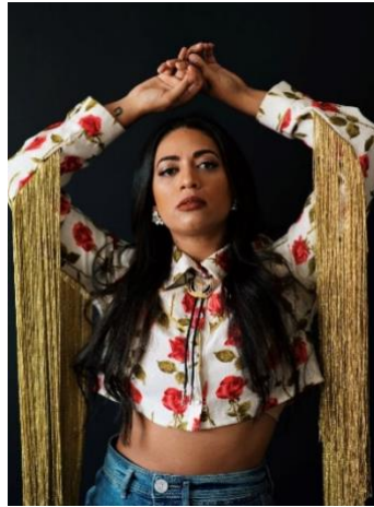
Madeline Edwards Download Photo