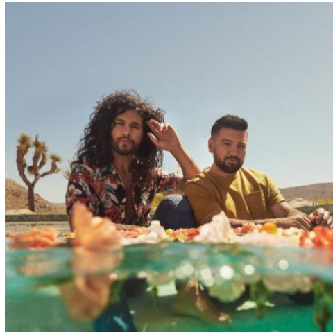
Dan + Shay