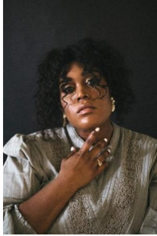
Brittney Spencer Download Photo